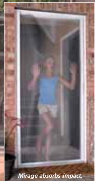
Mirage absorbs impact.