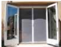
French Double Out-Swing

For use on windows, the maximum housing length available is 75" with a maximum 'pull' length of 55". Window screens can be mounted horizontally or vertically.